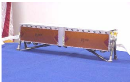
Mars Exploration Rover Battery

The battery assembly (below) measures approximately 16" by 4" by 4" and weighs about 17 pounds, which is about 5% of the total rover weight. It had to be built to take the vibration and acceleration of launch, eight months of travel in the cold of space to reach Mars, and more punishment through the landing phase, which included a jarring free-fall drop to the surface, bouncing and rolling within a protective cocoon of airbags. After all that, the batteries came through with flying colors, providing all required power until the solar cells could be deployed. And since then, despite being intended to operate for