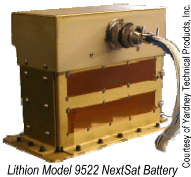
Lithion Model 9522 NextSat Battery

Two batteries are for main booster power, another four are for the Flight Termination System, and six more batteries supply power to fire various ordnance functions, such as stage separation.