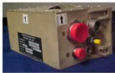
Yardney Silvercel Batteries for Atlas V Rocket Launcher