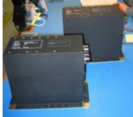
Lithion Model L1147 ASTRO Batteries