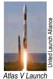
United Launch Alliance